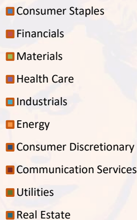
FTSE 100 Sector Exposure